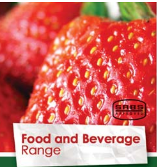
Food and Beverage Range

As manufacturers of industrial chemicals since 1981, Safic is the first chemical company in Africa, audited by Swiss Cert and SABS to be certified as an ISO 9001:2000, ISO 14001 and OHSAS 18001 compliant company. In addition Safic is a member of the CAIA.