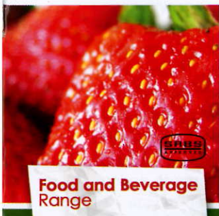
Food and Beverage Range